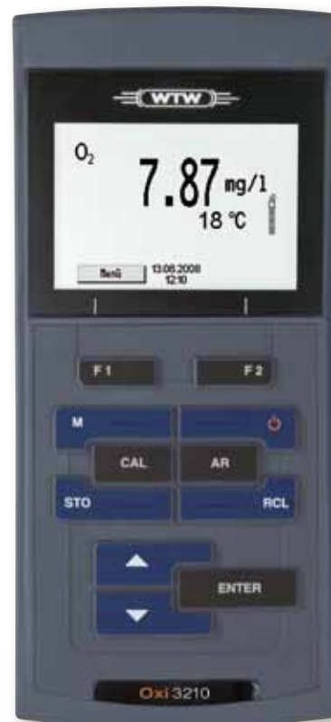
ProfiLine Oxi 3210